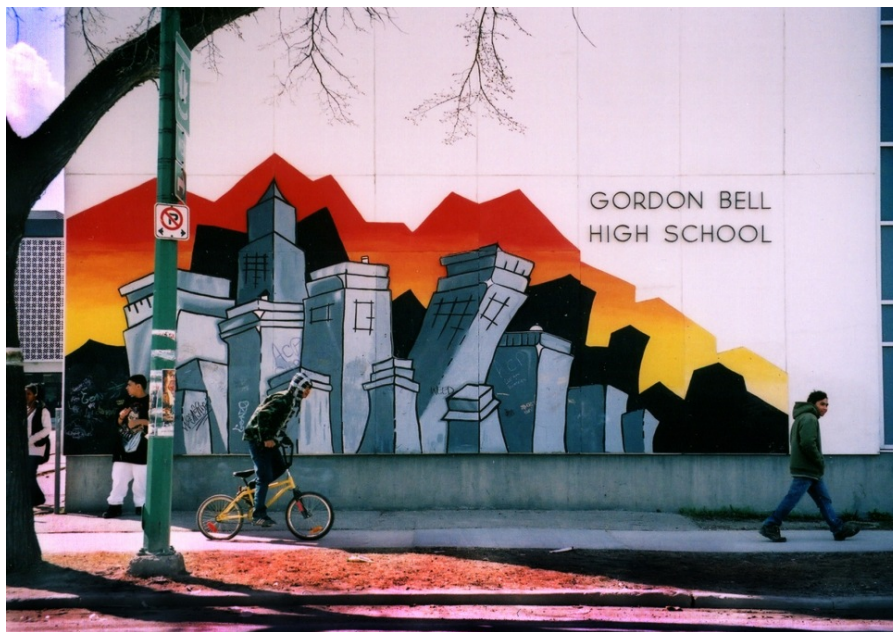
Gordon Bell High School in Winnipeg – location of The Storytelling Class