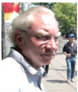
Senator Larry Campbell is just one of many whose voices you'll hear

Greater Victoria Anti-Stigma Week; Drug Use, Dignity and Human Rights", the sponsored by the Greater Victoria Anti-Stigma Coalition.