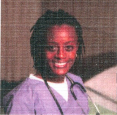
School of Nutrition