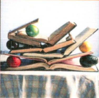
School of Occupational and Public Health