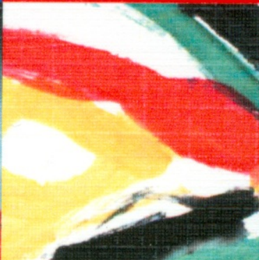
School of Urban and Regional Planning