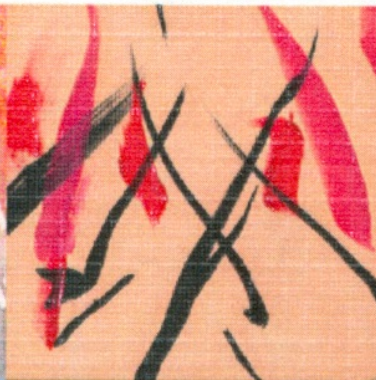
School of Disability Studies