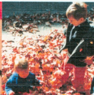
School of Early Childhood Education