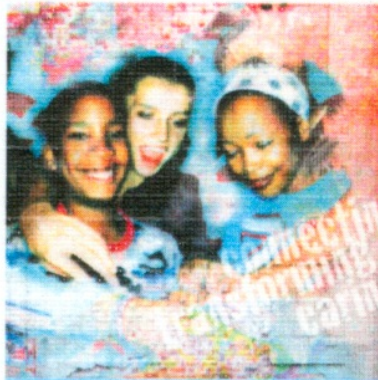
School of Child and Youth Care