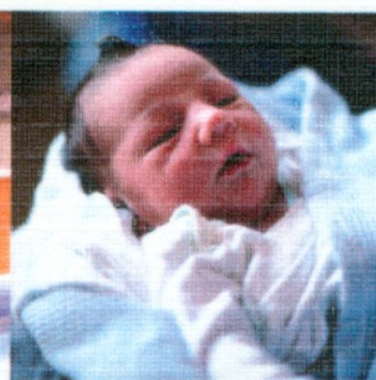
Midwifery Education Program