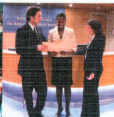
School of Health Services Management